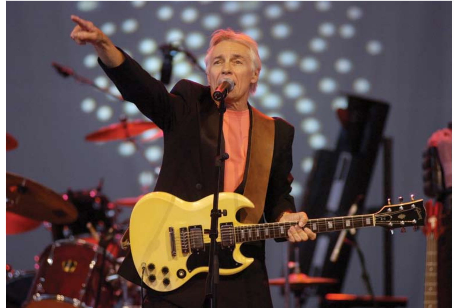
Herb rockin' the crowd during the Skip 'N Go Naked tour.