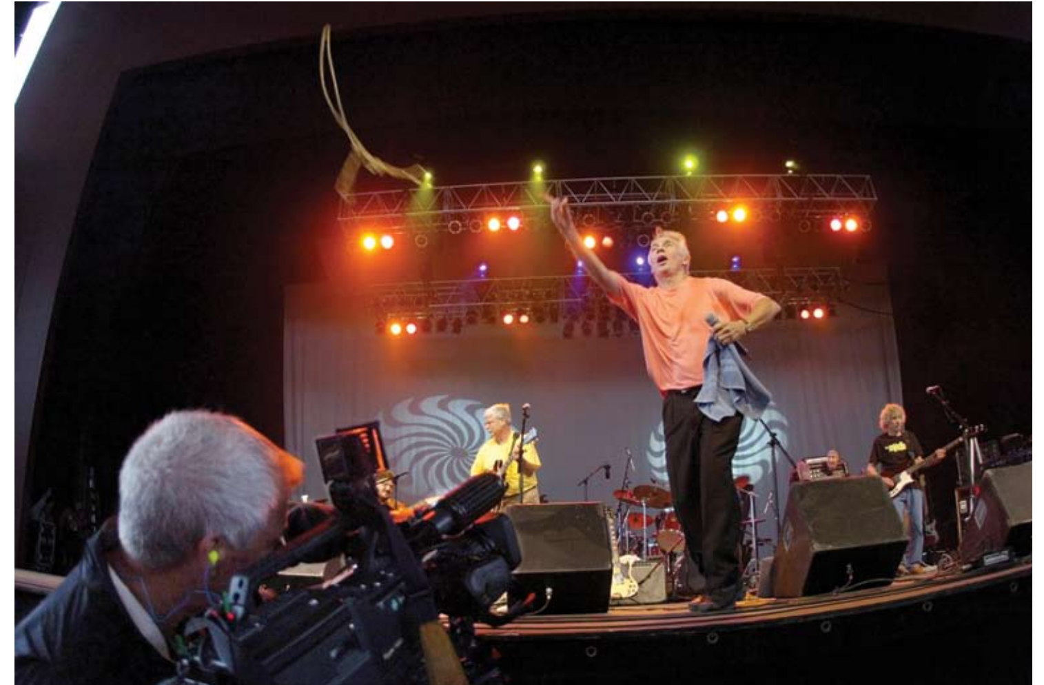
The Invictas being filmed for their Today Show appearance.

Probably every city and town in America has had a local band and bar that brings back fond memories. We started our band during the early '60's and were fortunate enough to be fairly successful. The most memorable place we played was a tavern called Tiny's Bengel Inn.